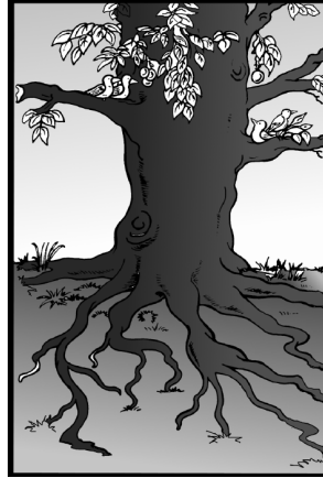
Fig 1.1 "Has your conflict grown out of control?"

Many show off their achievements, PhD's and other qualifications, yet they cannot find and destroy the root of their own conflict.